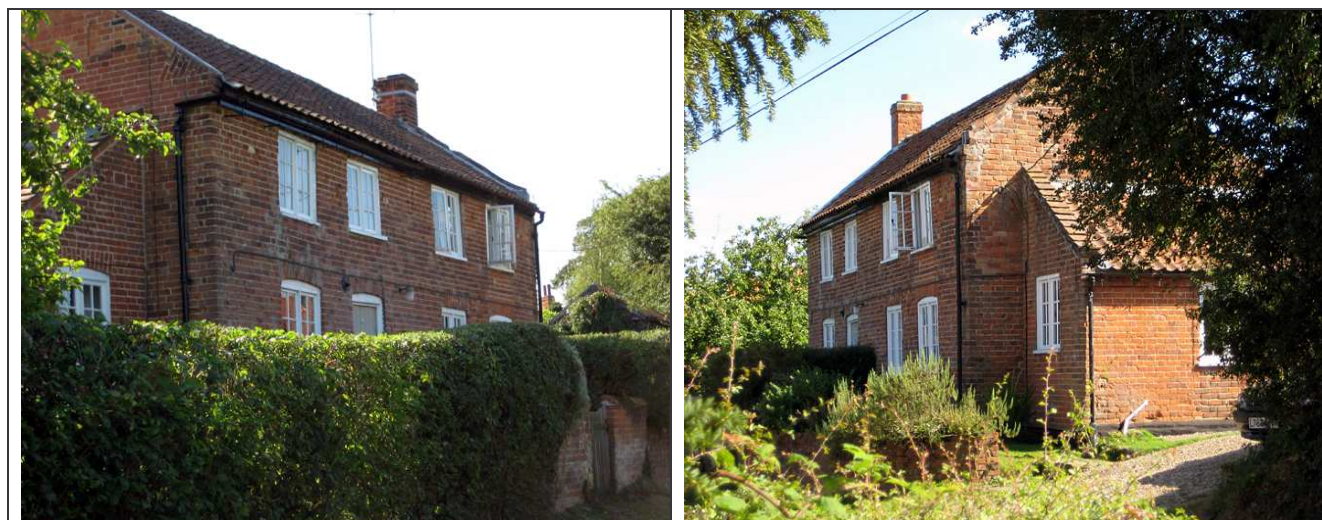
No. 90 Itteringham Common